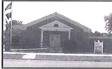
American Legion Post #49 Wilmington, Ohio

The event will be hosted by the Wilmington American Legion Post 49.